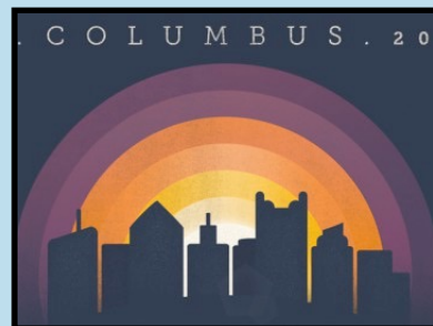
Columbus LT (p.2)