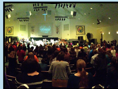
Winter Retreats (p.3)