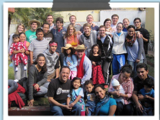
h2o team in Guatemala

This year we have (and will go) to Guatemala, Haiti, Germany and Russia. We have seen 53 students participate in God's work of redemption. We have seen Him heal and restore individuals, families and communities we have visited. We have also seen Jesus move in the lives of the students who have gone on these trips. It is amazing how God can use a student's step of faith when they go to an unfamiliar place to help fulfill the Great Commission. God uses these trips to open students' eyes to the needs of the poor and needy, what God is doing around the world, and the part He has for them to play in what He is doing. That is why we have a prayer goal that every member of h2o would go on an overseas mission trip while they are in college. We know that these trips motivate students to run hard for Jesus the rest of their lives. Please join us in praying that God would make this prayer and hope a reality. ■