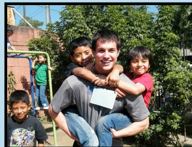
Slice of Life (p.4)