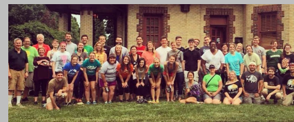
H2O CITY (PG.2)