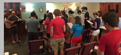
SUMMER TEAM (PG.2)