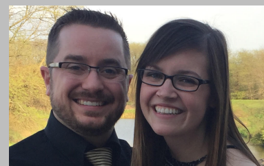
SLICE OF LIFE (PG.4)