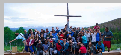
WINTER PARK LT (PG.3)