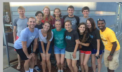
COLUMBUS LT (PG.3)